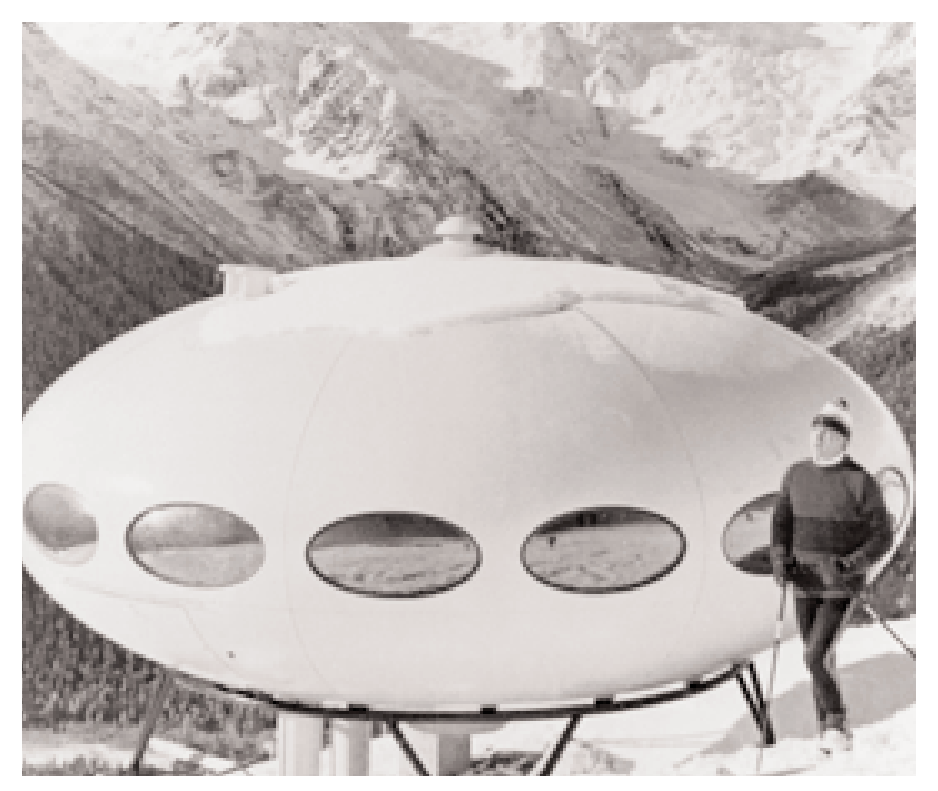
A room with a view: Futuro: A New Stance for Tomorrow