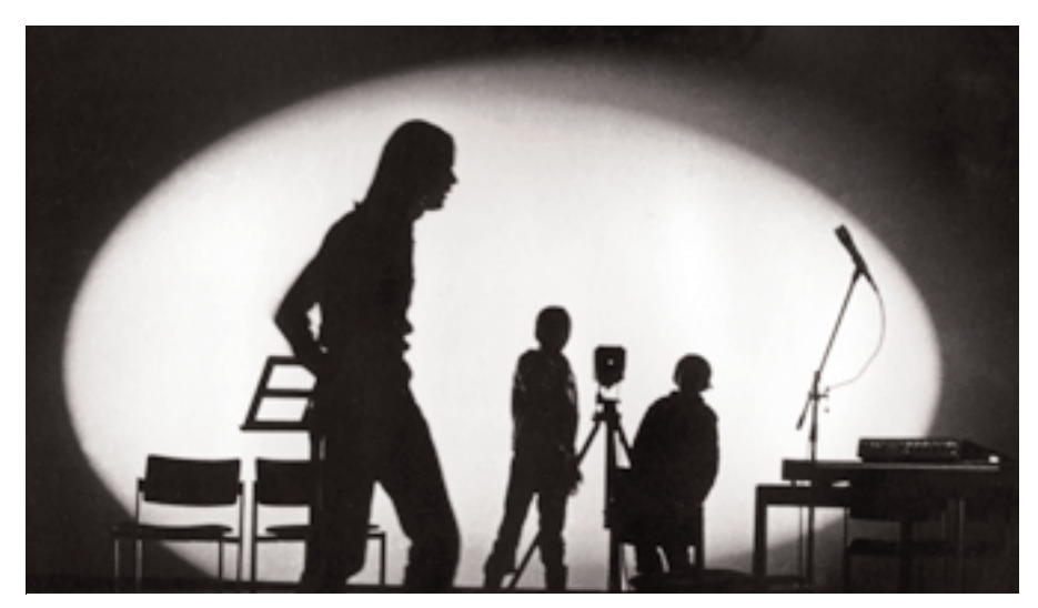
Strangeways here we come: The Future Is Not What It Used to Be